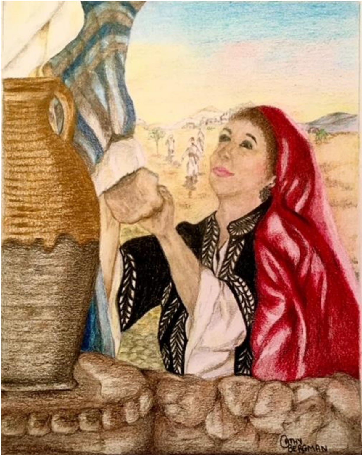
The Virtual Walk, "Broken and Given," Day 2

Picture yourself going to Jesus with your empty jug . . . put it down . . . hear him assure you that He loves you . . . he knows all about you and he loves you . . . he knows the mistakes . . . he forgives you . . . he knows your needs and he knows your hopes and dreams . . . he will be everything for you . . . that is what he wants you to know.